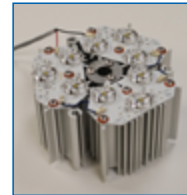
9L XRLED MODULE