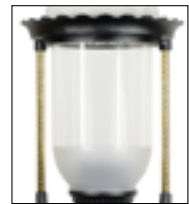
BR Available with Optional Brass Ropes